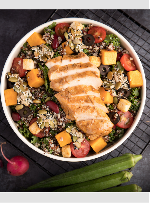
How does a person make the healthiest choices?

This syllabus was created to inform students in this course of the learning expectations. As a person interested in the health professions, this course will be extremely valuable. The syllabus is your resource during the semester to be successful in the course. The schedule is located at the end of the syllabus and on Canvas.