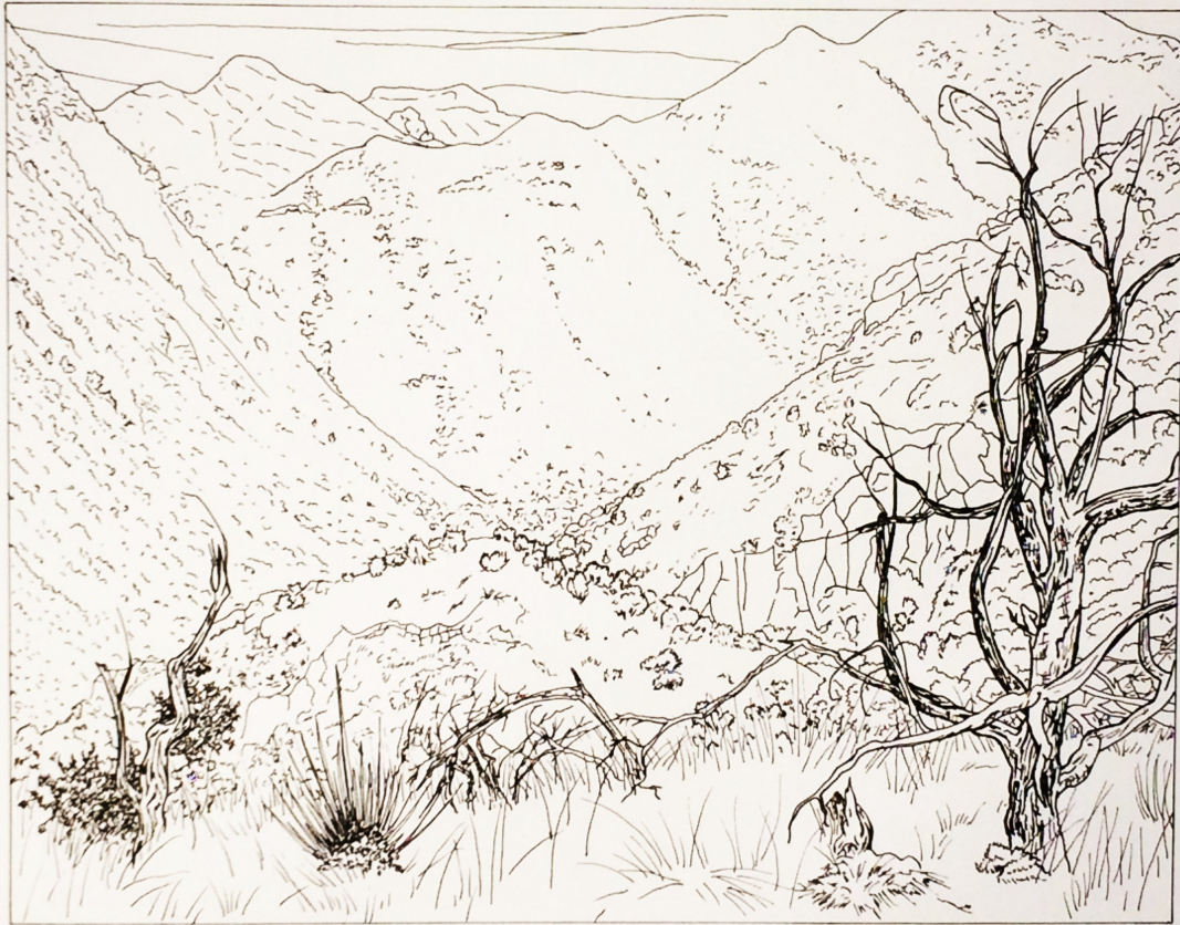
BLUE CANYON FROM LAGUNA MEADOW